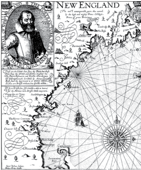
Captain John Smith's map of New England, 1616

STRUCTURE: Sabin Americana, 1500-1926 offers basic and advanced search options. Users can search among or within specific works, view the results of their full-text searches on facsimile pages from the original works, save their lists of results, specific pages or works using InfoMark technology, e-mail citations of selected works, or print and download portions of the works themselves.