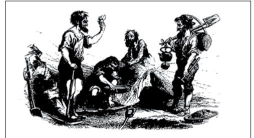
Illustration from a book on the California Gold Rush, 1850

To have instant access to this collection, visit www.galetrials.com/GDCTrial.aspx . Contact your Gale Representative, call 1-800-877-GALE or go to gdc.gale.com .