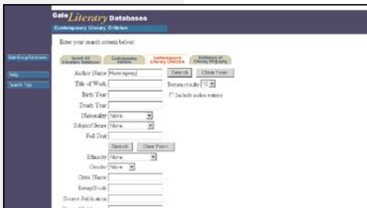
▲ The main search page offers a variety of search options