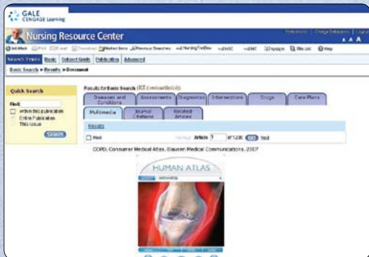
Detailed medical animations bring anatomy "to life".