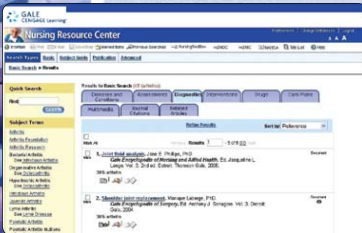
Tabs that reflect the nursing process make the interface easy to use.