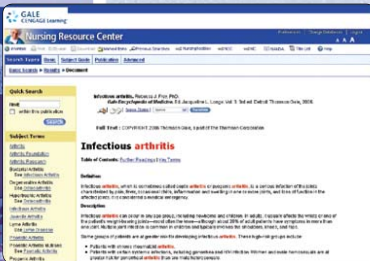
Entries offer complete information, often including a description of the term searched.